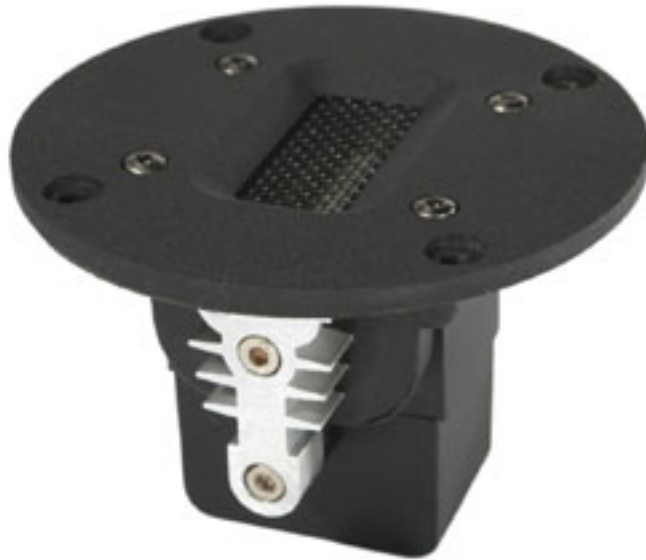
NeoCD1.0 true ribbon tweeter